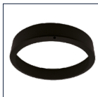
Frame Black 1000183