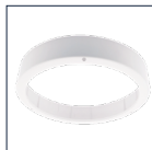
Frame White 1000169