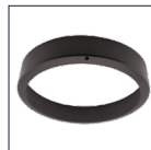
Frame Grey 1000176