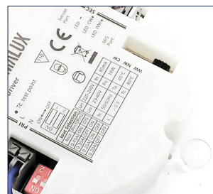
CCT/Multi wattage Switch